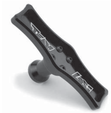
LOSB4604 17mm Wheel Wrench