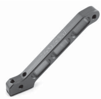
LOSA4417 Alum. Rear Chassis Brace