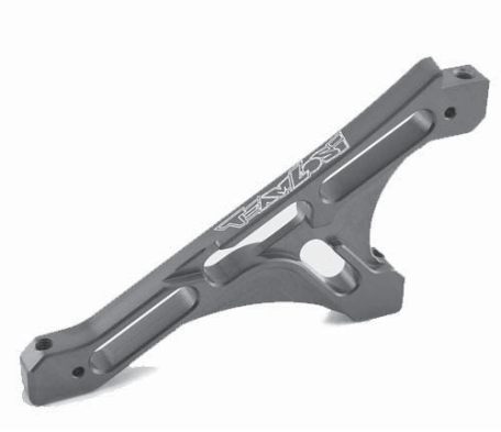
LOSA4416 Alum. Front Chassis Brace